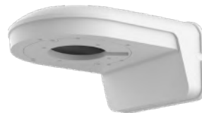
PR-WB-A Designed Wall Bracket