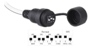
DIP Switch for Output Selection