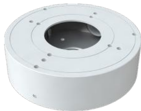
PR-JB14IP64 Large Junction Box