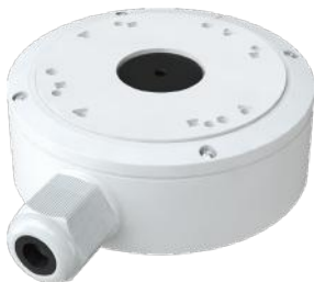
PR-JB14IP66 Large Water-proof Junction Box