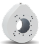
Junction Box (PR-B37JB) is available