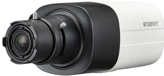
* Lens not included