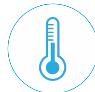
Digital temperature compensation