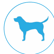
Superior pet immunity

Texecom understand that reliability underpins the fundamental trust in an intrusion alarm system and has developed the Capture range to be our most reliable, most resilient, most robust and most trustworthy range of motion detectors, to date.