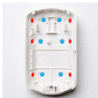
Flexible mounting points