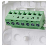
Adjustable terminal block