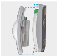
Front-loaded fully sealed electronics