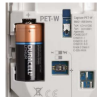
Automatic wireless setup