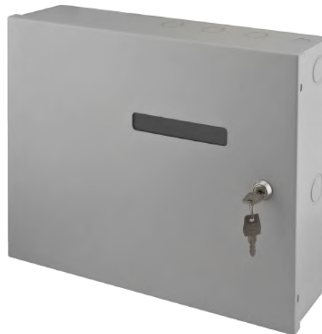
Set of cables included