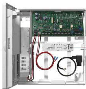
MG5075 with 110-220V / 75W Internal Power Supply