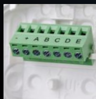
Adjustable terminal block