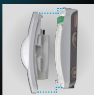
Front-loaded fully sealed electronics