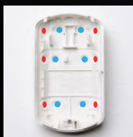
Flexible mounting points