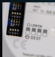
Selectable CloakWise & Dual Tech modes