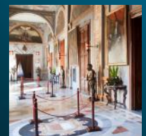
Museums & Galleries

For technical specs, see the manual via the TexecomPro mobile app. Visit pro.texe.com for more info.