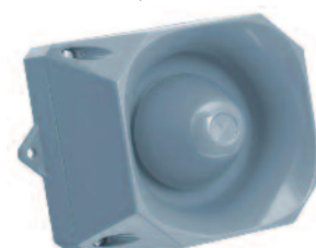
Asserta Midi Grey