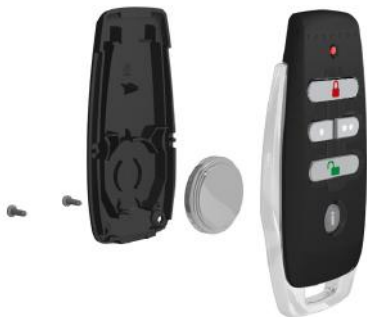
Figure 2 – Replacing the REM25 Battery

This product contains a coin cell battery. If the coin cell battery is swallowed, it can cause severe internal burns in under two hours and can lead to death.