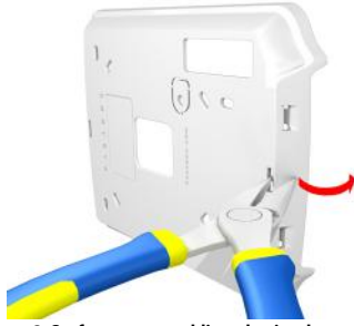
Figure 2: Surface-mount cabling plastic tab removal