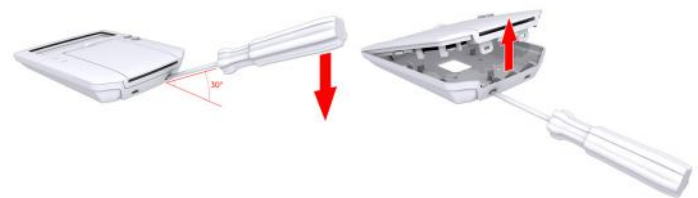
Figure 1: Opening the K32+