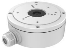
DS-1280ZJ-S Junction Box