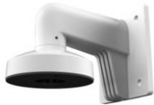
DS-1272ZJ-110-TRS Wall Mount