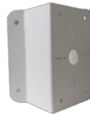
DS-1276ZJ-SUS Corner Mount