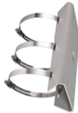
DS-1275ZJ-SUS Vertical Pole Mount